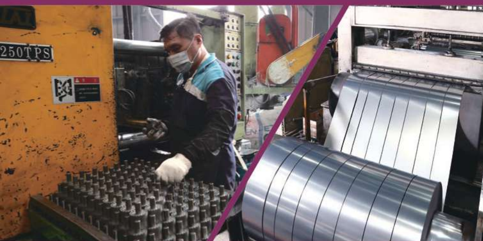
壓鑄機 Die- casting machine