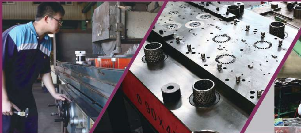
模具保養 Mold maintenance