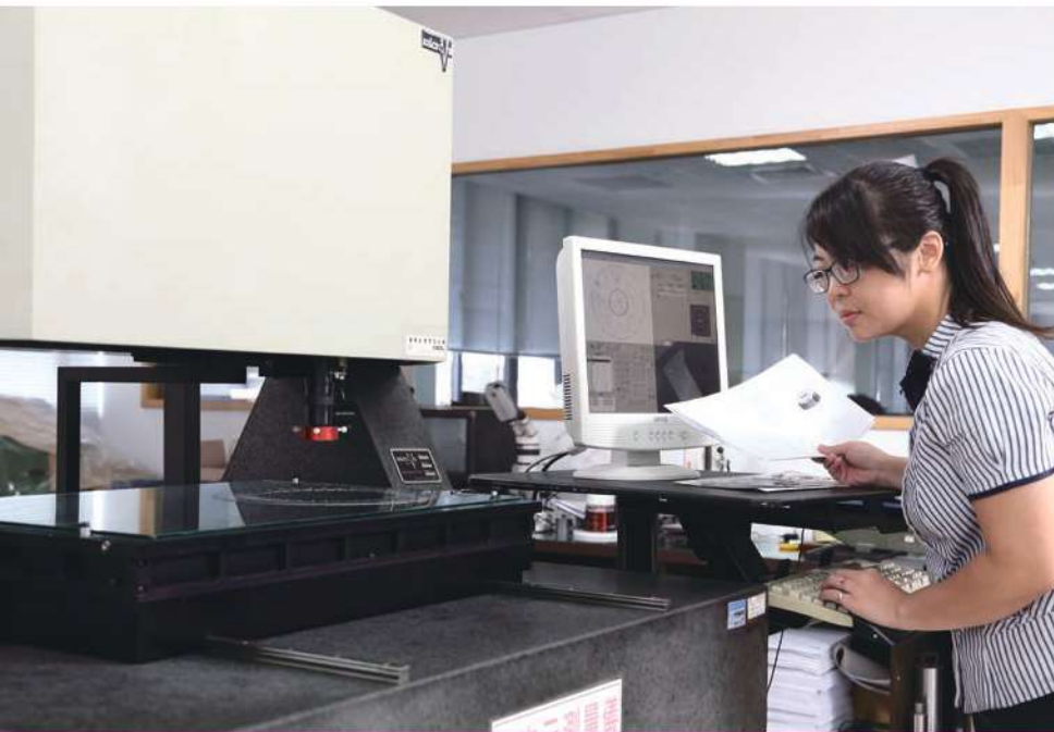
非接觸式三次元測量機 Un-contact 3D measuring machine