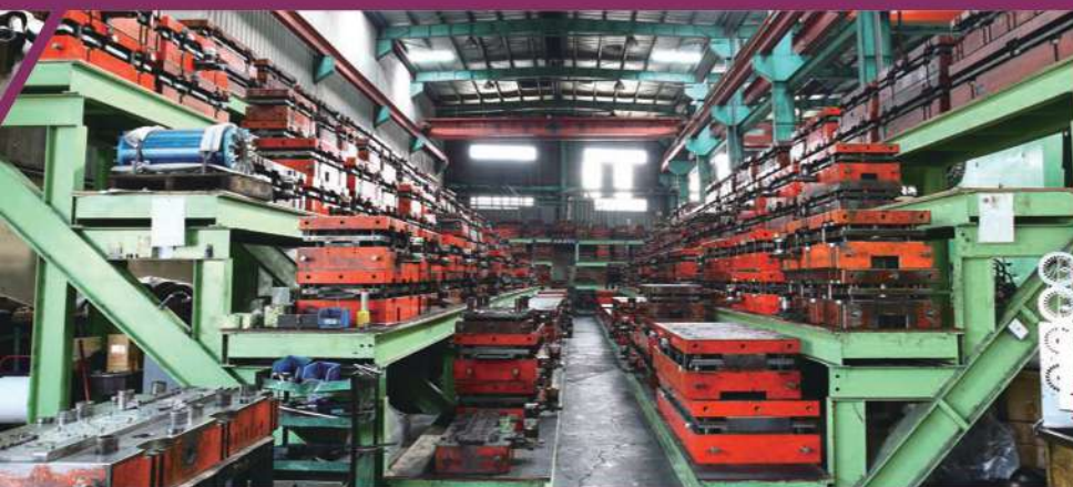
模具庫 Mold warehouse