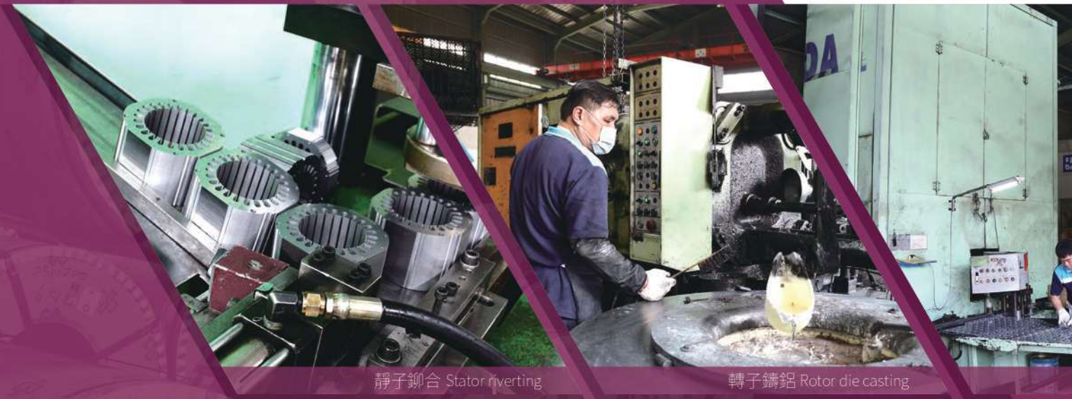
靜子鉚合 Stator riveting