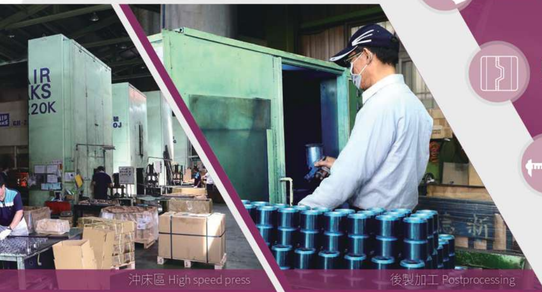
沖床區 High speed press