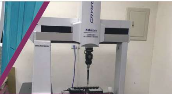
三次元測量儀 3D measuring machine