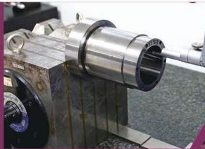
二次元測量儀 2D CMM