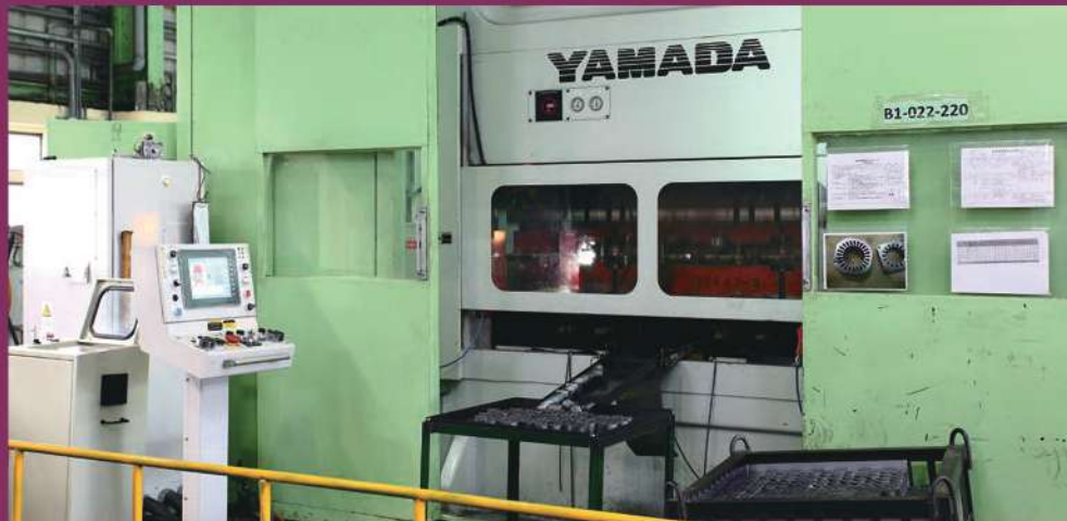
高速沖床 High speed press

Our main products is motor core. The maximum production capacity is 5,000 ton per month. The total plant is approximately 16,000 square meter.