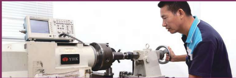
電樞測試儀 Armature tester